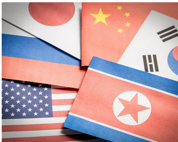
Flags representing the six countries that make up NEACD.

The sixth NEACD was held on April 4, 1997 , in Harriman, New York, with the support of the Japan National Institute for Research Advancement. The meeting focused on the security of shipping lanes in the region. A maritime trade workshop took place, featuring academics, diplomats, and industry officials from Australia, China, Singapore, South Korea, and the United States. Following the dialogue, the first DIS study project took place in Honolulu, Hawaii from September 29-October 1, 1997, and was followed by a Principles of Cooperation study project meeting from October