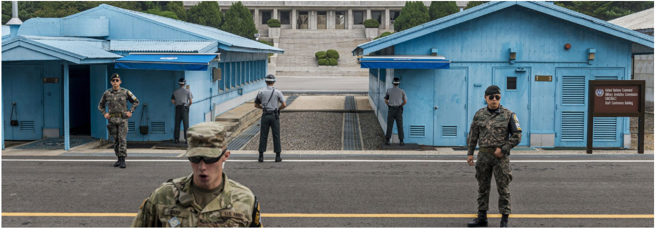
The Joint Security Area between North and South Korea.