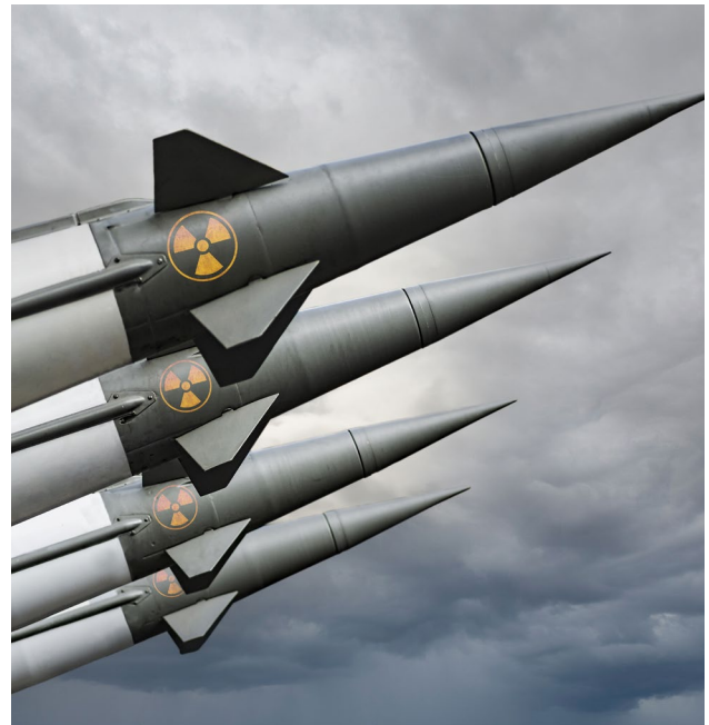
Nuclear missiles aimed upwards.