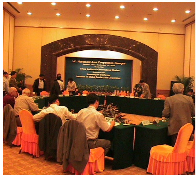
The 14th meeting of NEACD in 2003, in Qingdao, China.

The dialogue also produced a historic first: representatives from the World Bank and International Monetary Fund took part in meetings to discuss economic issues with North Korean government officials.